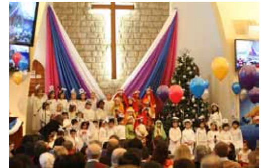
Musical, "It's A Party"

We had a month-long celebration of Christmas, beginning with the lyrical telling of the Christmas story by around 100 children in the musical, It's A Party , which was followed by a super-fun birthday party for Jesus. We also honored our volunteers by presenting gifts prepared by the children on our Teacher Appreciation Day . We closed Sunday School for the year with our Christmas Fair . The year was packed with much joy and love pouring from the servant hearts of many volunteers and parents who not only ministered to our children but to our staff.