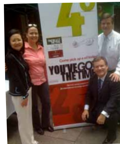
Faith Comes By Hearing Campaign

During Lent, we had a Small Group Campaign where we listened to the New Testament in 40 days founded by Faith Comes By Hearing . Some small groups could not wait for their weekly gatherings and created virtual small groups to share their reflections of daily reading through Facebook. It was a time of growth and renewal.