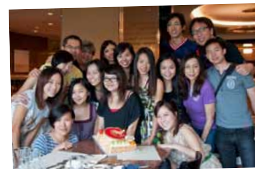
Small Group: Middle-C

Through fellowship and pastoral care, we met people where they were and walked alongside those who were weary physically and/or spiritually. We sent cards, visited people at homes and hospitals, offered prayer, and provided counseling. The Family in Need Committee also offered practical help. It is a joy to see individuals standing back on their feet once again as they experienced the love of God and their church family.