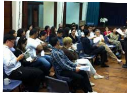
3-in-1 small group study

Recovering from Divorce and Separation Course ran in the spring and autumn this year. Each course runs for seven Thursday evenings and had a total of 20 guests who attended. The course provides individuals who have been or are going through divorce or separation from a long-term relationship with support. Through a series of talks and small group discussions, we equip them to cope with and ultimately move on from trauma that divorce brings to individuals and families. This course meets a growing need that has often been neglected and is also a great way to