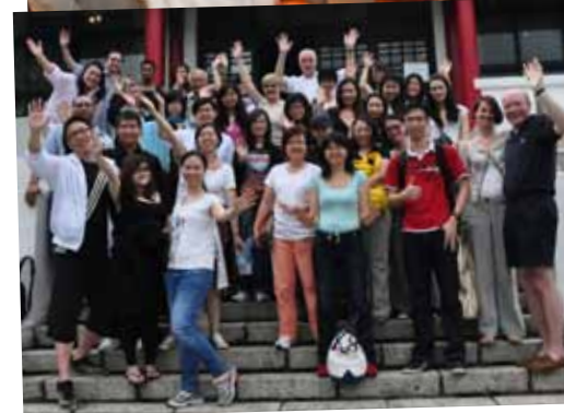
Alpha Weekend in June 2011