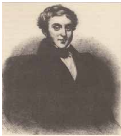
Rev. James Legge

Legge served as pastor from 1844-1867 and from 1870-1873. He began translating the Chinese classics into English. His translations are used to this day and still in print. He was a major figure in early Hong Kong and the founder of the very first government school (now called Queens College). The Legge Lectures have been named in memory of James Legge.