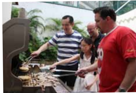
Kickoff BBQ Sunday

Ministry, Recovery Courses and Prayer Ministry we reached out, encouraged, and ministered to individuals where they were in their season of life.