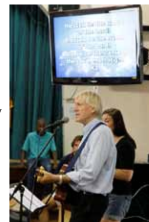
Worship - U Cafe

Word of God was presented in the form of new Bibles, a welcome addition! Many thanks to the generous spirit of our members and friends. U-Café would not be possible except for the efforts of volunteers bringing together technical aspects, music, creative design, and the beautiful food and fellowship provided for all who attend. May U-Café continue to thrive in the year ahead.