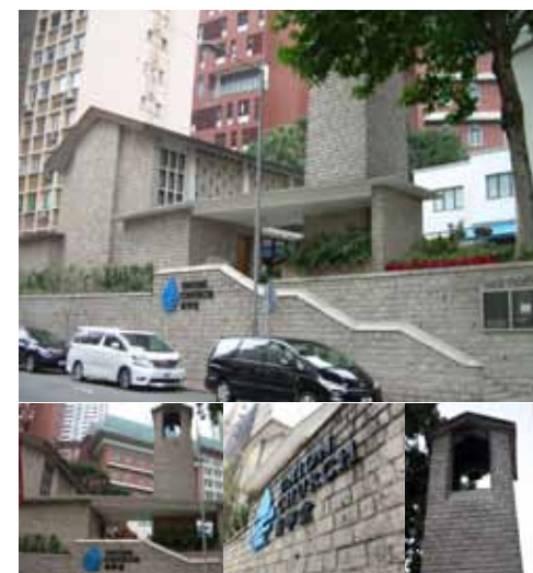
Union Church on Kennedy Road (2011)