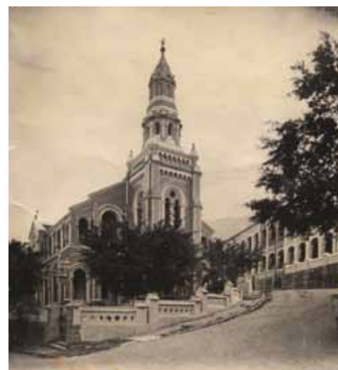
Union Church on Hollywood Road (1845)