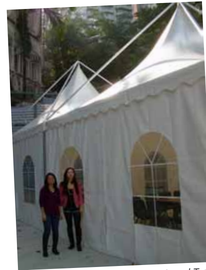
Upper Courtyard Tent

meetings as well as some office furniture for increased number of staff.