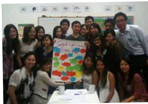
Summer Spiritual Refreshment