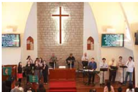
Sunday Contemporary Service

Our 11:00 AM Contemporary Service continues to grow and increase with new singers and players. Our worship leaders and team of volunteers have blessed us with new songs and inspiration to boldly worship God. We were pleased with the addition of new television screens to the sanctuary. This was well worth the time and effort involving three months of