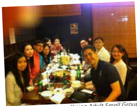
Young Adult Small Group

Small group ministry continues to provide coaching to the existing leaders, train new leaders, and launch more groups to meet the needs of the different segment of the congregation.