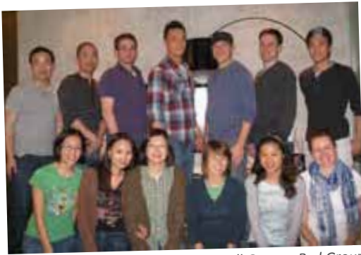
Small Group - Red Group

Another highlight of small group ministry was the Summer Spiritual Refreshment where individuals were welcomed to gather at church for a meal, teaching, and group discussion. We did John Ortberg's study Becoming God's Best Version of Me . A record high number attended this year, the Fellowship Hall was packed with about 100 people each week. Some were regular small group attendees, others came and had a taste of small groups. We learned that the best version of me is not to be the 'me' I